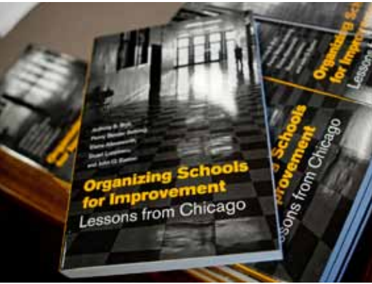
Organizing Schools for Improvement: Lessons from Chicago outlines five essential supports necessary to school reform.