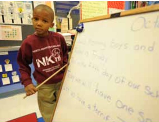
A student at the North Kenwood/Oakland campus of the University of Chicago Charter School reads aloud to his class.

of training, support, and accountability must be designed, tested, and implemented at scale.