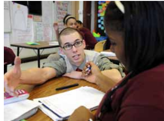
A Chicago UTEP candidate helps a University of Chicago Charter School student with a mathematics problem.