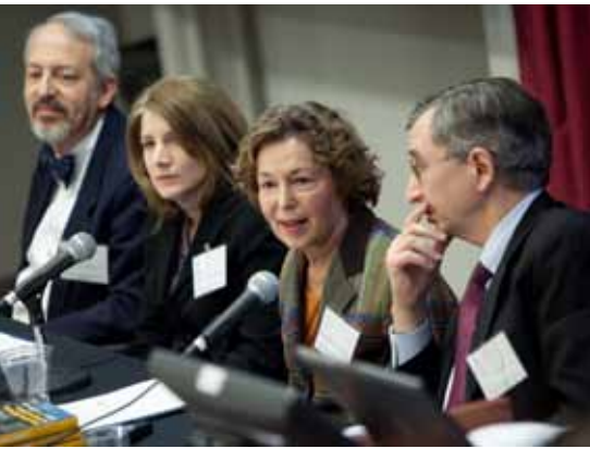
Researchers from the Consortium on Chicago School Research discuss their book, Organizing Schools for Improvement: Lessons from Chicago , at a panel event.

Each component of UEI is designed as a scalable model that is useful for research organizations, teacher training programs and schools, and school systems dedicated to the improvement of urban schooling.